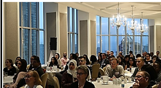
Faculty, students, alumni and special guests at the 2018 Ontario Public Service Breakfast